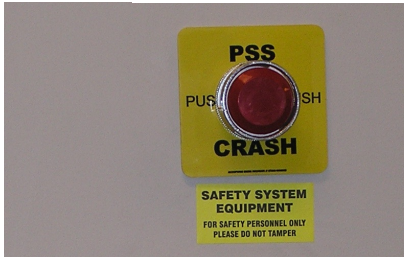
Beam crash button