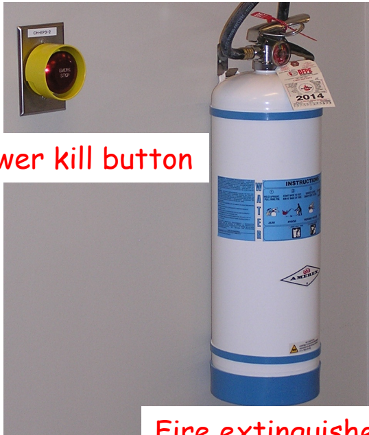
Power kill button