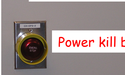
Power kill button

Both kill buttons trip all power in Counting Room